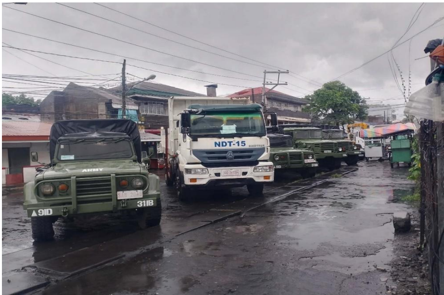
Standby Army Truck and PEO Truck at Albay PDOC