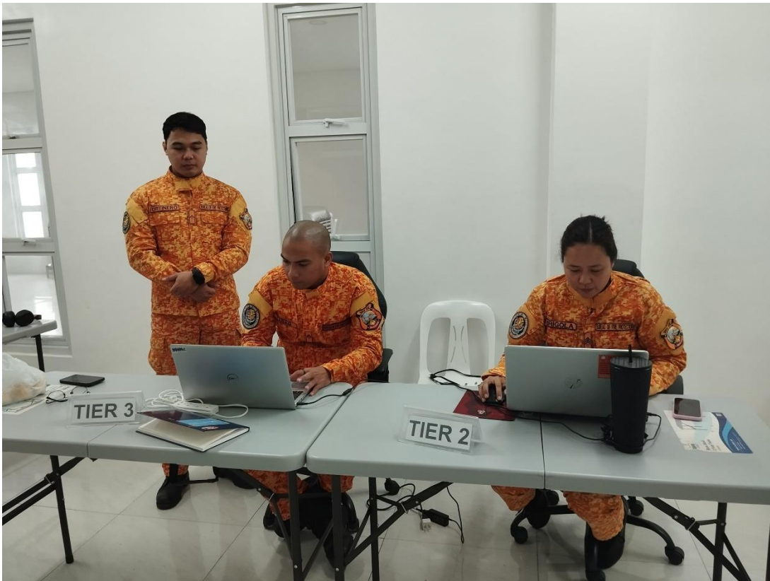
Coordination Meeting with Social Action Center, Catholic Relief Center, PSWDO, PHO, APHSO and APAO