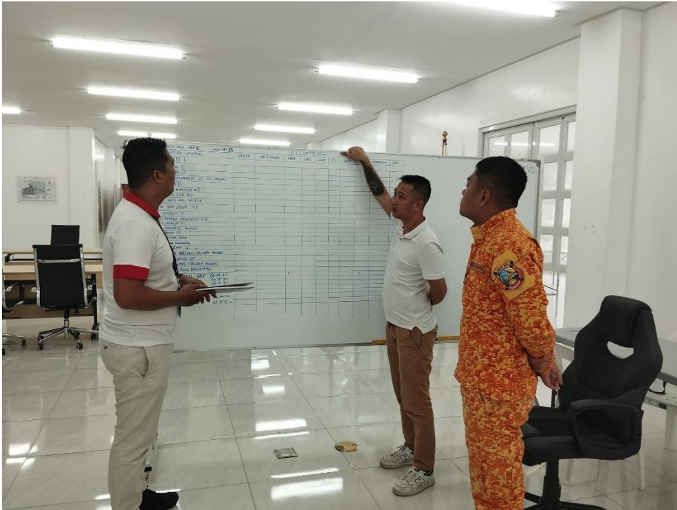
Distribution of 1,135 family food packs of relief goods from Malabog Warehouse, Brgy Malabog Daraga, Albay.