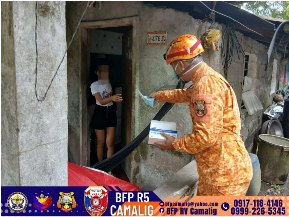
Distribution of 500 family food packs of relief goods from MAKAPA Inc., Tahao Road, Legazpi City to MDRRMO Camalig.