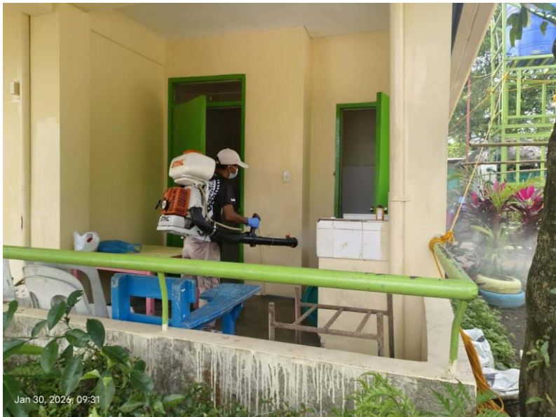
Standby PEO and Army Truck with personnel at Albay PDOC