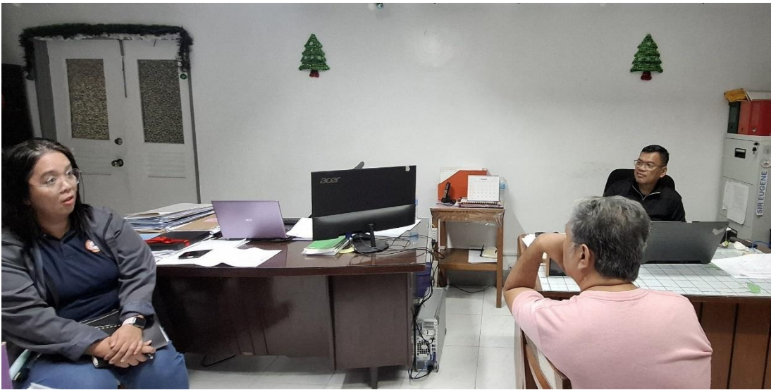
Maintained 24-hour PDOC Operation and Monitoring

Department of the Interior and Local Government (DILG) Albay and the Albay Public Safety and Emergency Management Office (APSEMO) held a meeting to discuss the increasing evacuation reports in comparison to the 6-kilometer Permanent Danger Zone (PDZ) population at risk data released by APSEMO. Following the meeting, APSEMO will draft a report analysis to further assess the situation and provide recommendations