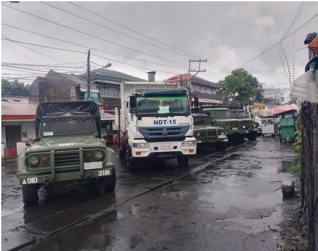
Standby Army Truck and manpower at Albay PDOC