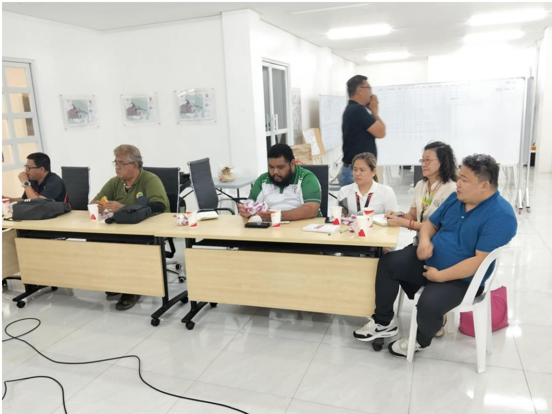
Provide media interview with Chinese Xinhua News Agency on Mayon Volcano Operation