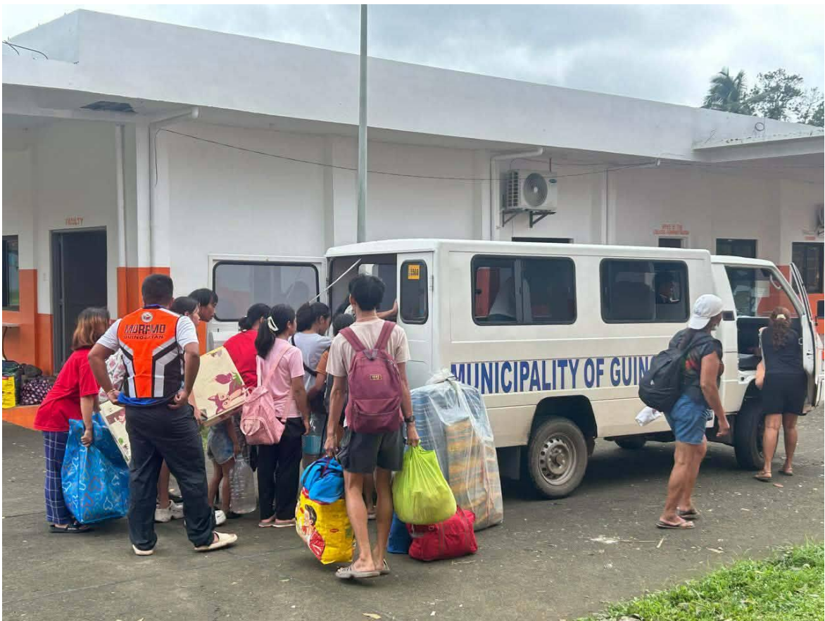
Decampment of LGUs