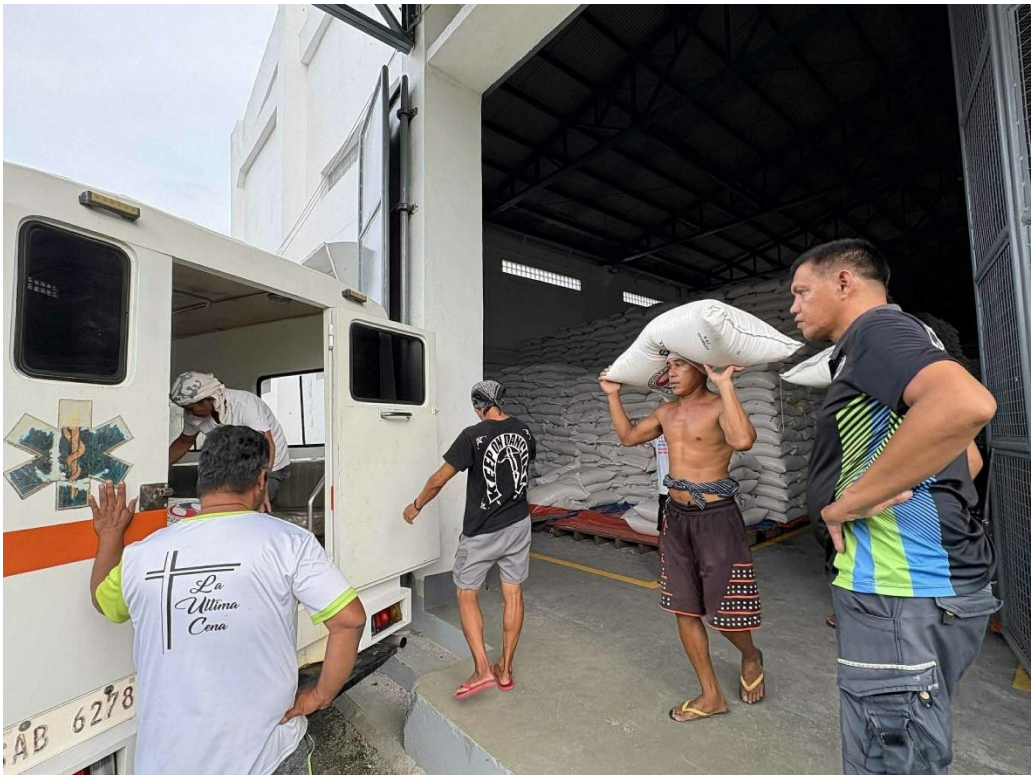
Distribution of NFA rice 100 sacks per LGU (18 LGUs) by PSWDO (on-going distribution)