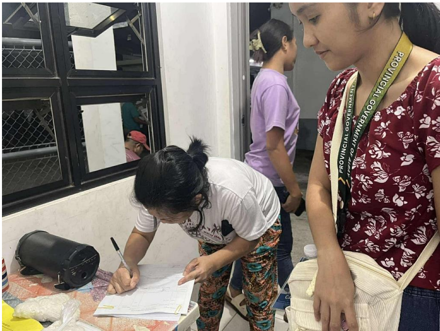
Distribution of additional NFA rice sacks per LGU (18 LGUs) by PSWDO (on-going distribution)