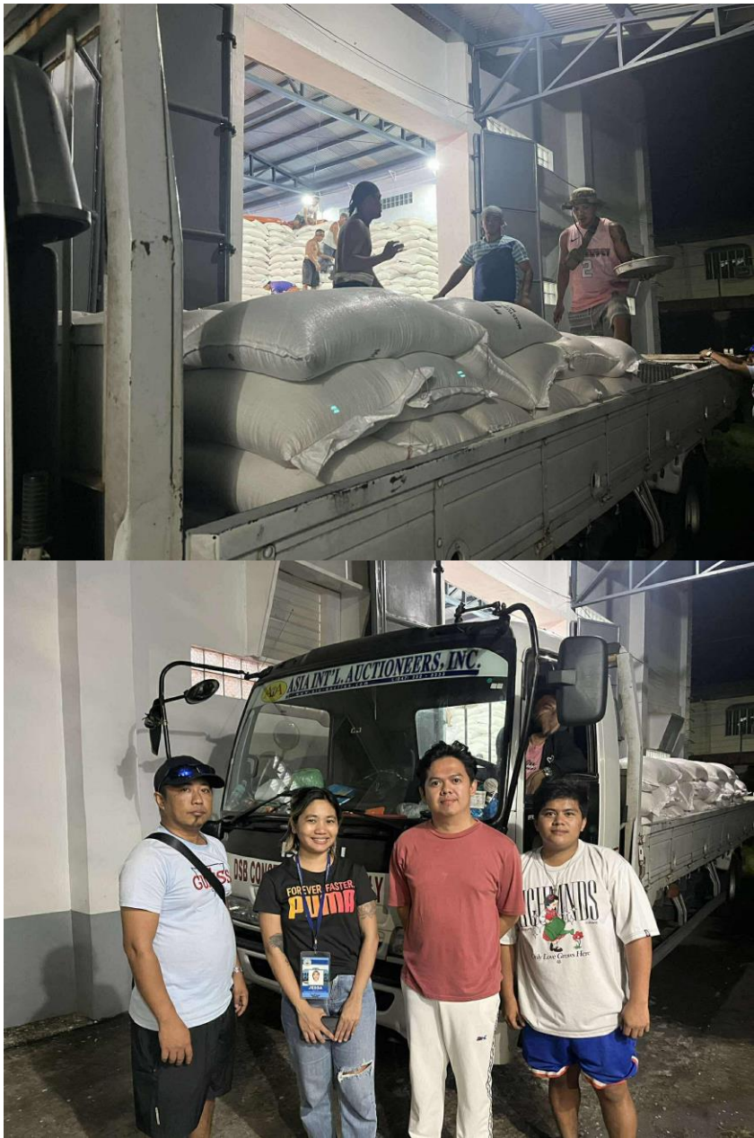
Distribution of NFA rice 100 sacks per LGU (18 LGUs) by PSWDO (on-going distribution)