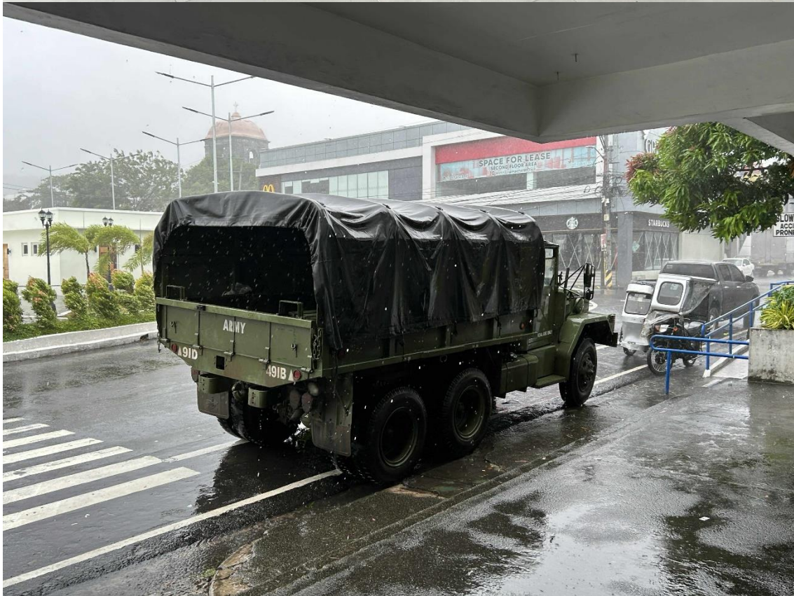
PHILIPPINE ARMY 49 th IB and 31 st IB on standby 2 units KM450, 1 KM250 and personnel at ASPSEMO Office